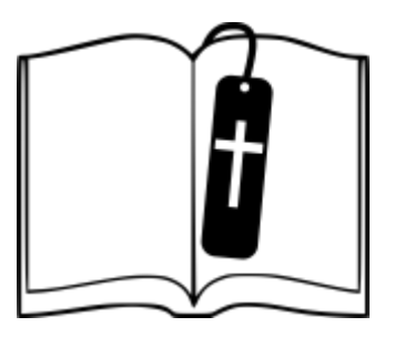
Bibles Available in Gathering Place

The 2016 Ingathering brochure is available at the back of the sanctuary and in the office.