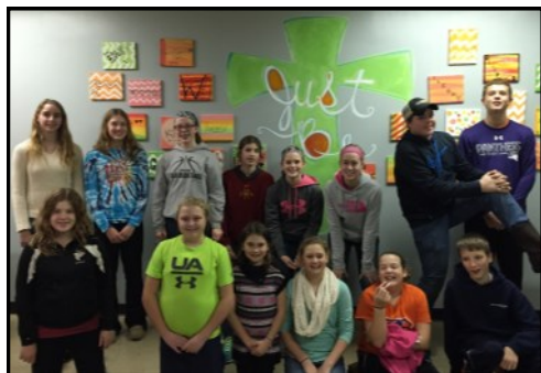
Junior Youth Group