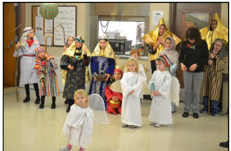
Kids for Christ presented their Christmas Pageant to the residents of Cedar Manor On December 13th.