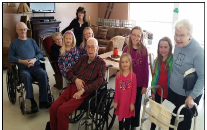
KFC at Cedar Manor

Wesley Woods – WesleyWoods.Camp@iaumc.org www.WesleyWoodsIowa.org