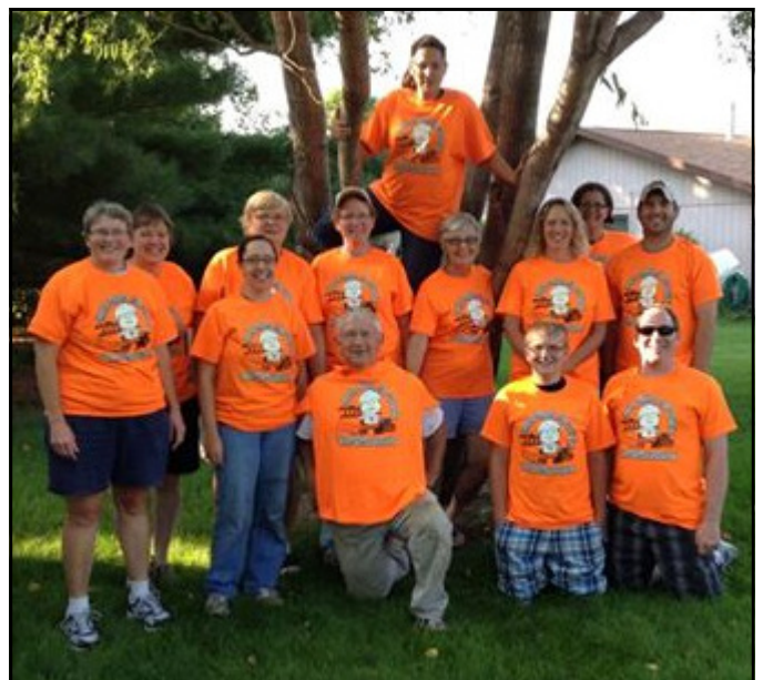
Work Trip 2014