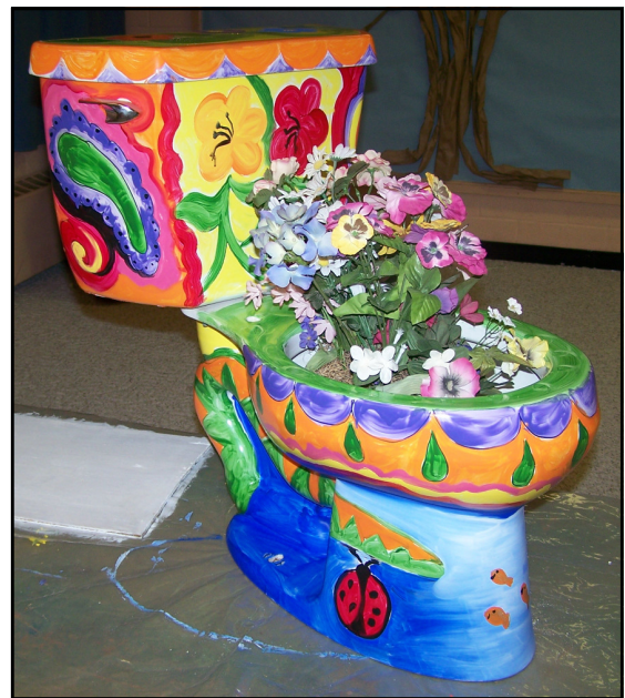
Traveling Porta Potty that was used for a Mission Work Trip FUNdraiser.

Gifts: General Fund $14,128.00, • Preschool Facility Use $100.00, • Remodeling Fund $30.00, • Upper Room $2.00, • Closed the Windows Fundraiser $760.00, • Apportionments $10.00, • Shared Blessings $324.78, • Copper Kettle $195.33, • Mission Work Trip $100.00, • Porta Potty - Work Trip $75.00, • Mission - Rummage Sale $40.00, • UMCOR $10.00, • Grand Total $15,775.11