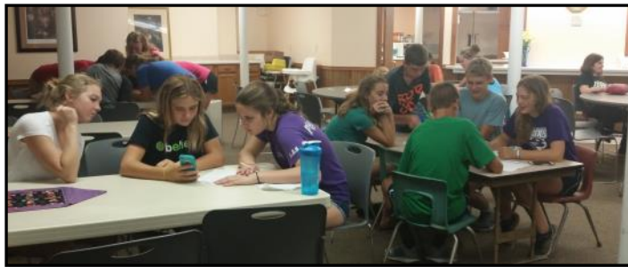
8th - 12th grade youth group.