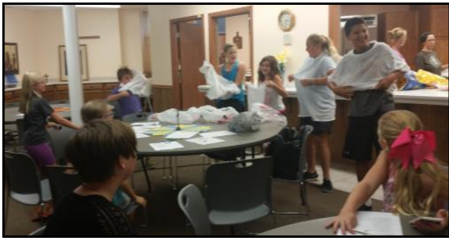
5th - 7th grade youth group.

Our September meeting had right at 40 kids; so glad to see such an amazing turnout! Be sure to invite friends! Attached is also the letter that explains time of meetings and a few other things, along with the enrollment form to be sure we have correct info. If you have not turned this in yet, bring it to the meeting or to Sunday school.