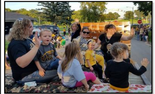
LFP students and staff in the Tipton Homecoming Parade on Sept. 14.