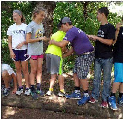
Confirmation Retreat 2015